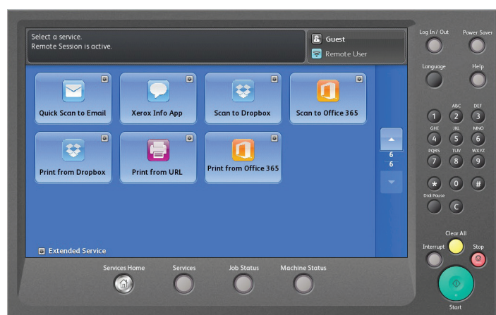
User Interface showing Xerox® ConnectKey Apps.